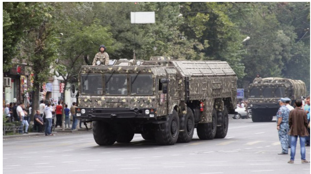
Armenian SS-26 Iskander Tactical Ballistic Missile

for the maintenance and modernization of the S-300 systems 104 . In fact, in the course of the S-400 negotiations, some Turkish experts criticized NATO for showing double-standards to Athens' S-300 inventory and Ankara's possible Russian arms procurements 105 .