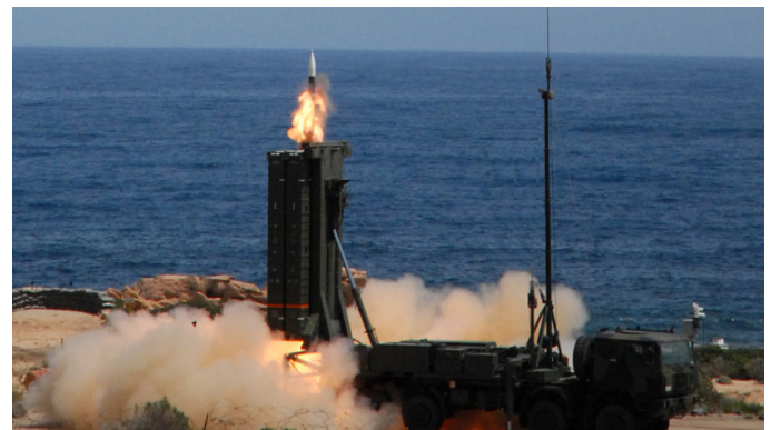
Aster-30 Block-1 Air and Missile Defense System

Despite the Turkish officials did not give any clue about the details of the abovementioned project, most probably, the goal is to integrate the Turkish defense industry into the Aster-30 Block-1 NT (NT: new technology) production efforts (B1NT). The B1NT program depends on an initial contract under French mandate in 2015, and the following Arrangement of Cooperation signed by French and Italian defense ministers in June 2016. Within this framework, the missile manufacturing giant MBDA is responsible for developing the new system of the Aster line 73 .