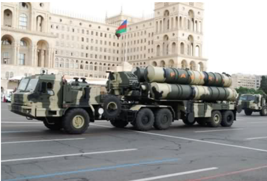
Azerbaijan's S-300 PMU-2 Air and Missile Defense System