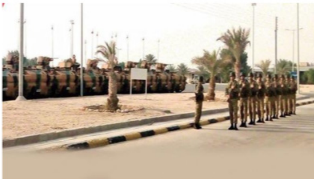
The Turkish contingent in al-Rayyan Base 18

Without a doubt, the most important article in the defense cooperation deal is the one that allows Turkish troops' stationing on the Qatari soil. However, contrary to speculations, the ratified treaty does not include a casus foederis 19 , a diplomatic clause determining under which circumstances the military alliance will be initiated, such as NATO's Article 5. Thus, Turkey is not legally committed to the national defense of Qatar. As a comparison, Turkish–Azerbaijani defense partnership, for example, does have open-ended clauses that can well be interpreted as casus foederis at times of war 20 . Turkey's forward basing in Qatar is also surely more than 'symbolic' 21 . Even the Turkish exclave in Syria, which is centered on the historical tomb of Suleiman Shah and has been guarded by a ceremonial watch squad for decades, led to complex issues including a Turkish evacuation and re-location