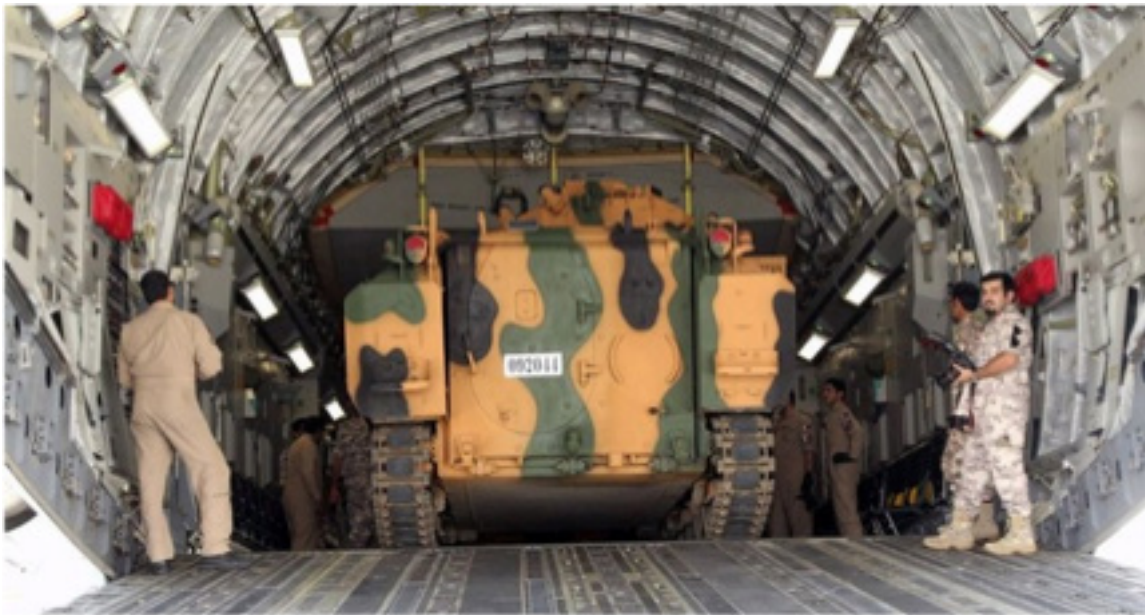
Turkish armored vehicles and troops being airlifted to the forward base in Qatar 17

would be headed by a two-star Qatari general and a Turkish brigadier general as the deputy commander. It was also reported that some 90 Turkish troops, the equivalent of a company, has been stationed in the Gulf nation's territory since 2015 13 . At the time of writing, some press sources indicated that the initial batch of the planned deployments could be as high as 1,000 troops, suggesting a possible adjustment in the force generation due to the pressing situation of Qatar 14 . Furthermore, the Turkish media reported that training activities already began on June 19, 2017 15 . Lastly, the proceedings showed that Ankara is soon to finalize establishing a separate joint mission between the Turkish Gendarmerie and the Qatari internal security forces 16 .