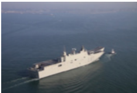
Juan Carlos 1 approaching to her homeport, Rota Naval Base in Spain 76

M: Military Missions, A: Auxiliary Missions, C: Civilian Missions, for detailed assessment 75