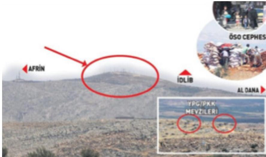
Possible geo-location of the Turkey's basing in Idlib according to the Turkish daily Sabah 113

this would provide the Turkish Armed Forces with very important geostrategic advantages against the PKK-affiliated YPG elements in Afrin 112 .