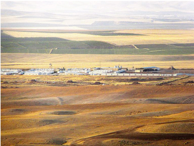
Turkish forward operating and training base in Bashiqa, 2016 99 .

Although the Turkish government stated that the deployment was conducted upon the demand from the Kurdistan Regional Government of Iraq for an anti-ISIL training mission, Baghdad reacted strongly indicating that its sovereignty was being violated 96 . Following the tensions, Ankara relocated its contingent in Bashiqa to the KRG controlled territory 97 . In January 2017, the Turkish Prime Minister Binali Yildirim met his Iraqi counterpart Haider al-Abadi in Baghdad to resolve the issue. It was reported that an agreement was reached to honor Iraq's sovereignty rights and to address Turkey's security concerns at the same time 98 . Still, by the last deployments, Turkish troop number in Iraq is estimated to be "a few thousands".