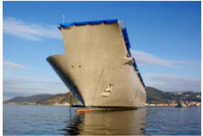
Juan Carlos 1 – class vessel with the launched bow and ski-jump 73

could cover light aircraft carrier and amphibious assault tasks. In fact, the initial aim was to combine the characteristics of the Principe de Asturias–class aircraft carrier and the Galicia–class amphibious ships in the Spanish Armada at the time.