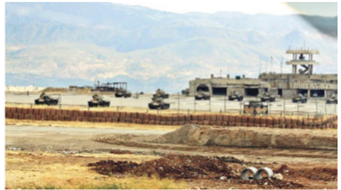
One of the rare media footages of the Turkish contingent in Bamerni Airport 93

Current Turkish forward military basing in Northern Iraq is centered on a reinforced battalion-level armored unit in the Bamerni Airport. Elite commando units are also stationed in Kanimasi and a few villages (i.e. Begova) to prevent terrorist infiltrations into the Turkish territory. 92 In addition to these deployments and their surrounding detachments, the Turkish Special Operations Command has a liaison missions in Iraq for a long time.