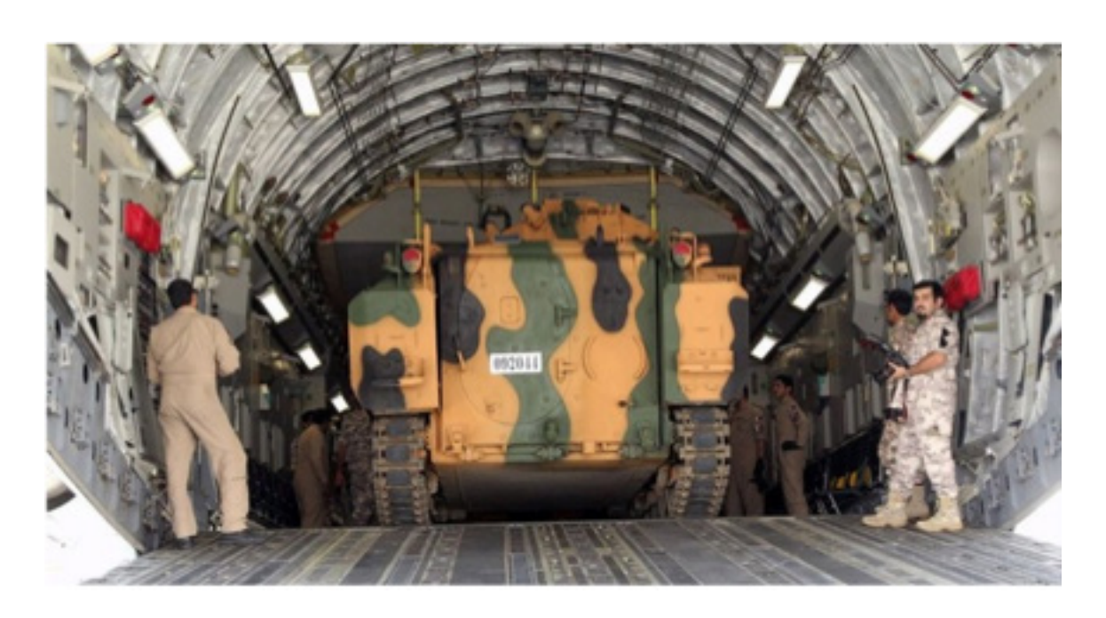
Turkish armored vehicles and troops being airlifted to the forward base in Qatar 17

would be headed by a two-star Qatari general and a Turkish brigadier general as the deputy commander. It was also reported that some 90 Turkish troops, the equivalent of a company, has been stationed in the Gulf nation's territory since 2015<sup>13</sup>. At the time of writing, some press sources indicated that the initial batch of the planned deployments could be as high as 1,000 troops, suggesting a possible adjustment in the force generation due to the pressing situation of Qatar<sup>14</sup>. Furthermore, the Turkish media reported that training activities already began on June 19, 2017<sup>15</sup>. Lastly, the proceedings showed that Ankara is soon to finalize establishing a separate joint mission between the Turkish Gendarmerie and the Qatari internal security forces<sup>16</sup>.