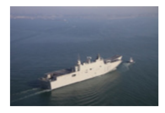
Juan Carlos 1 approaching to her homeport, Rota Naval Base in Spain <sup>76</sup>