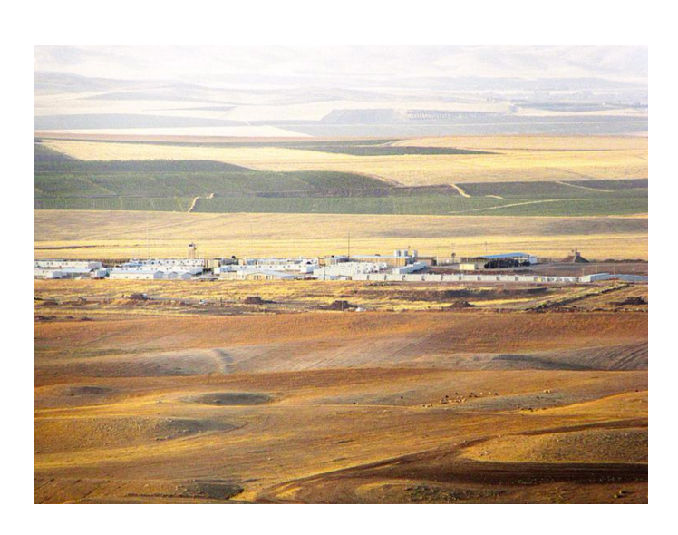
Turkish forward operating and training base in Bashiqa, 2016 99.

Although the Turkish government stated that the deployment was conducted upon the demand from the Kurdistan Regional Government of Iraq for an anti-ISIL training mission, Baghdad reacted strongly indicating that its sovereignty was being violated following the tensions, Ankara relocated its contingent in Bashiqa to the KRG controlled territory In January 2017, the Turkish Prime Minister Binali Yildirim met his Iraqi counterpart Haider al-Abadi in Baghdad to resolve the issue. It was reported that an agreement was reached to honor Iraq's sovereignty rights and to address Turkey's security concerns at the same time Still, by the last deployments, Turkish troop number in Iraq is estimated to be "a few thousands".