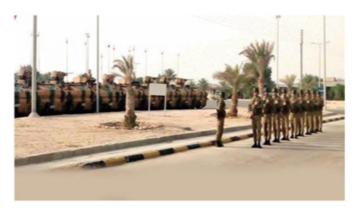
The Turkish contingent in al-Rayyan Base 18

Without a doubt, the most important article in the defense cooperation deal is the one that allows Turkish troops' stationing on the Qatari soil. However, contrary to speculations, the ratified treaty does not include a casus foederis19, a diplomatic clause determining under which circumstances the military alliance will be initiated, such as NATO's Article 5. Thus, Turkey is not legally committed to the national defense of Qatar. As a comparison, Turkish-Azerbaijani defense partnership, for example, does have open-ended clauses that can well be interpreted as casus foederis at times of war<sup>20</sup>. Turkey's forward basing in Qatar is also surely more than 'symbolic'21. Even the Turkish exclave in Syria, which is centered on the historical tomb of Suleiman Shah and has been guarded by a ceremonial watch squad for decades, led to complex issues including a Turkish evacuation and re-location