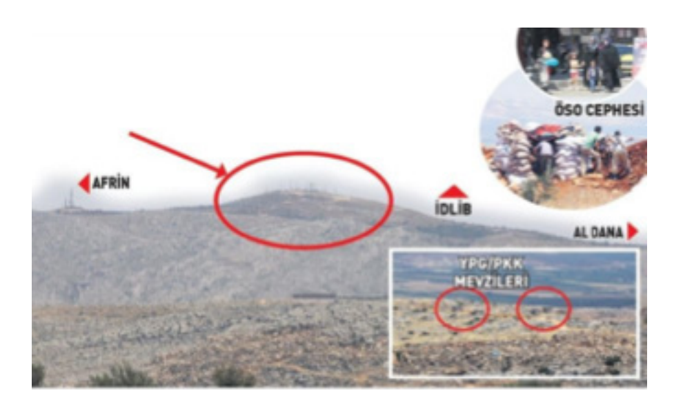
Possible geo-location of the Turkey's basing in Idlib according to the Turkish daily Sabah 113

this would provide the Turkish Armed Forces with very important geostrategic advantages against the PKK-affiliated YPG elements in Afrin<sup>112</sup>.