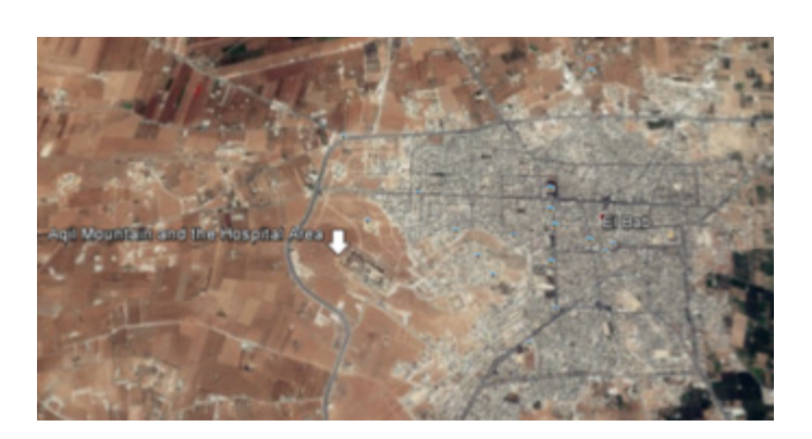
Aqil Mountain remains the most significant high-ground around al-Bab

the conventional forces resembles Turkey's burgeoning contingent in Qatar. In Northern Cyprus, for example, Turkey does not deploy gendarmerie forces. One explanation for that could be internal security priorities. The Turkish Gendarmerie is an expert internal security force which performs a wide array of missions ranging from law enforcement to counter-terrorism. For some time, Ankara has been building Jarablus as a stable and governable area in northern Syria, which could absorb Turkey's refugee burden to some extent. It is reported that around 66,000 local children are being educated in the schools built by Turkey, and Ankara is trying to turn Jarablus into an attractive settlement option for the displaced Syrians<sup>105</sup>. Thus, the gendarmerie units will probably run partner capacity building and assistance missions to train the locals in maintaining public order and preventing terrorist infiltrations into the cleared areas. In fact, according to the Deputy PM, the Turkish bases will train and equip the local partners<sup>106</sup>, probably within the context of the abovementioned partner capacity-building activities. Notably, in May 2017, Turkey's Anadolu Agency reported that the Turkish Armed Forces has been running an intensive training program since late March 2017 to boost the Free Syrian Army's combat capabilities<sup>107</sup>.