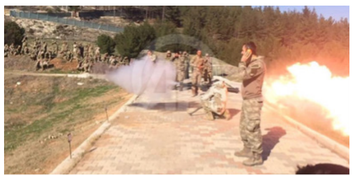
Turkish official news agency posted some pictures from the Free Syrian Army (FSA) training 108