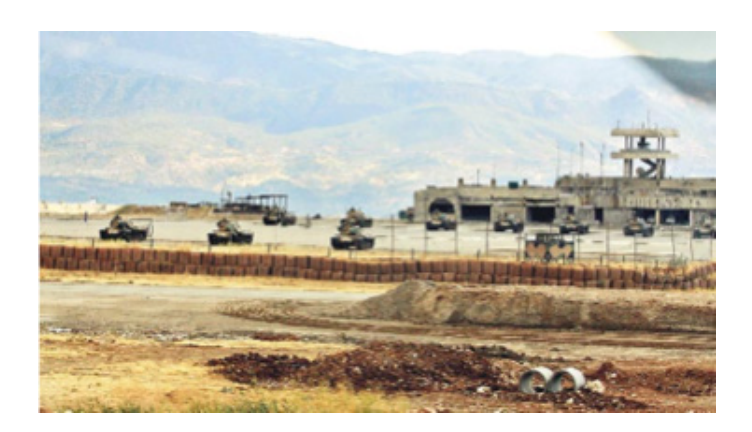
One of the rare media footages of the Turkish contingent in Bamerni Airport 93

Current Turkish forward military basing in Northern Iraq is centered on a reinforced battalion-level armored unit in the Bamerni Airport. Elite commando units are also stationed in Kanimasi and a few villages (i.e. Begova) to prevent terrorist infiltrations into the Turkish territory. <sup>92</sup> In addition to these deployments and their surrounding detachments, the Turkish Special Operations Command has a liaison missions in Iraq for a long time.